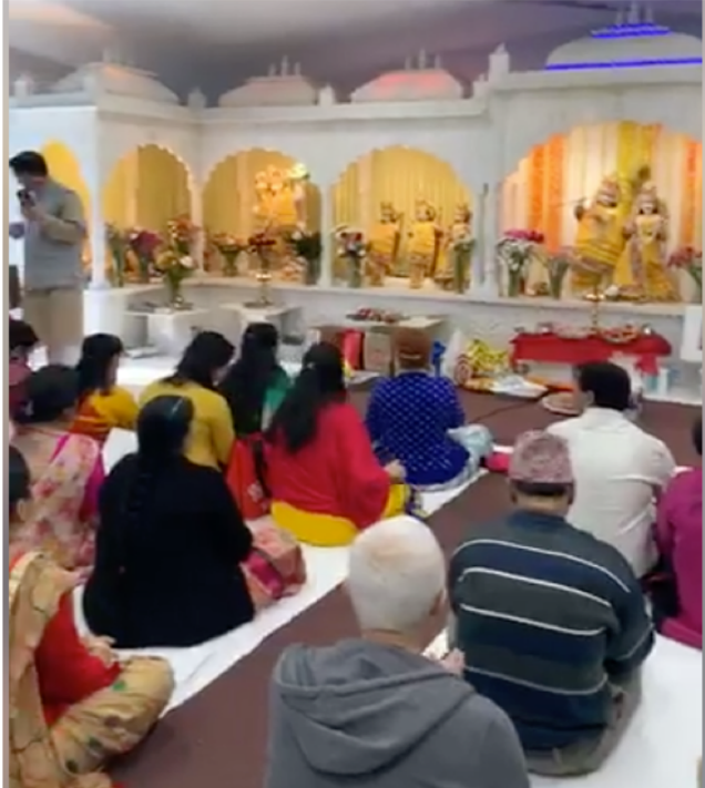
Geeta Ashram 200+ attendees.